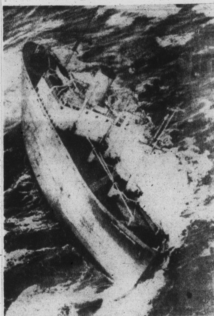
STILL HANGING ON—Rough seas still were pounding the American Freighter "Flying Enterprise" today while her courageous captain clung to his post in a personal battle against the sea. (Story, Page 1.)