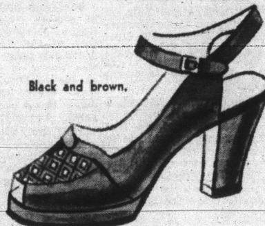
Black and brown.

This product has no connection whatever with the American National Red Cross.