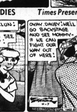
ROOTS AND HER SUPPLIES T: P: RACING DAYS 4-10 R-M-F-Su: