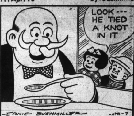
—By Al Capp