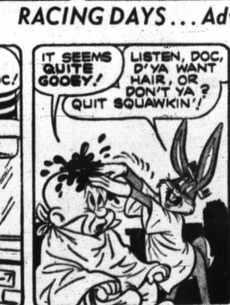
BUGS BUNNY . . . RACING DAYS . . . Adventure Strip . . . Starts Apr. 10