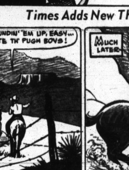
CAPTAIN EASY Times Adds New Thrill RACING DAYS Apr. 10 —By Turner