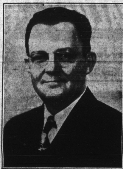
SENATOR DUDLEY J. LeBLANC

The continued increasing demand for HADACOL, one of the truly great medical discoveries given to the world by Senator Dudley J. LeBlanc, has made it necessary to decrease the ration allowance on HADACOL from six to two bottles.