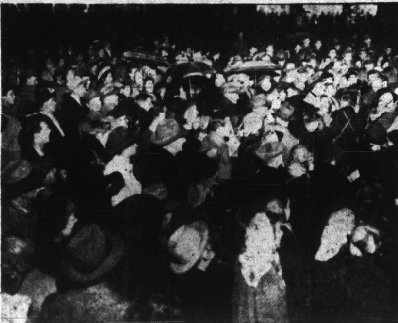
The crowd braves rain at the Circle auction.