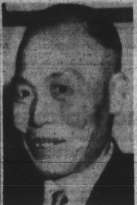
Li Tsung-jen... What gives?

If any Nationalist commander could be considered a strong candidate for American aid, it is this "Kwansien" general of Kwangsi province about whom official U. S. observers have had little but good to report. They have repeatedly pictured him as a victim of Chiang's stubborn know-it-all control of Nationalist military fortunes.