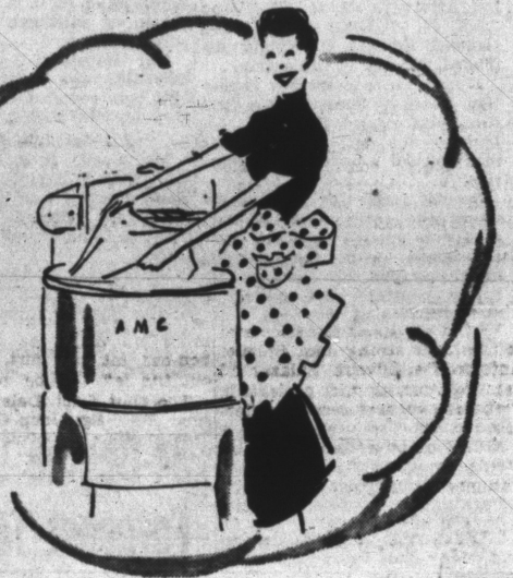
Model A19 . . . 79.95

A 7-pound capacity washer with 23-gallon triple-coated white porcelain tub. Smooth rolling casters; sturdy Chamberlain wringer with 2-inch balloon rolls, target safety release.