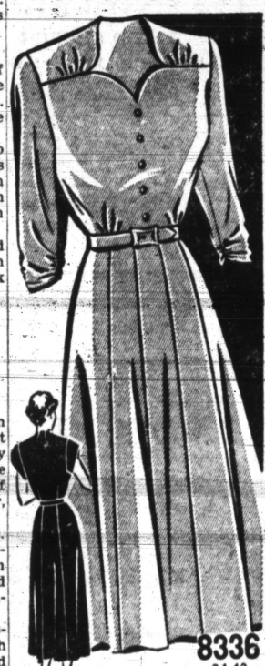
By SUE BURNETT

Graciously designed to flatter the slightly larger figure, this frock is perfect for afternoon wear, or those occasions when you want to look your best. Trim with novelty buttons, and perhaps a flower.