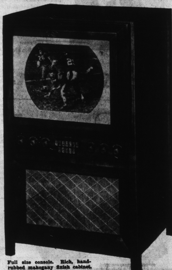
Full size console. Rich, hand-rubbed mahogany finish cabinet.

REG. $459.50 VALUE NO MONEY DOWN Small Weekly Payments CALL RI-8355 for FREE Home DEMONSTRATION No Cost or Obligation Service Within One Hour