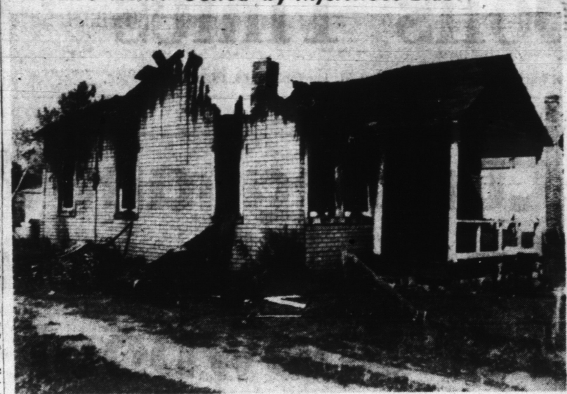
The Irvin Sparks home in Mars Hill after two mystery fires struck.