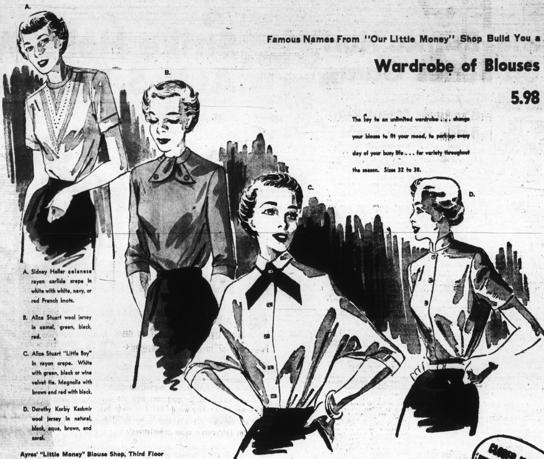
A. Sidney Heller celanese rayon carlisle crepe in white with white, navy, or red French knots.

The key to an unlimited wardrobe... change your blouse to fit your mood, to perk up every day of your busy life... for variety throughout the season. Sizes 32 to 38.