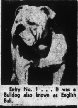
Entry No. 1... It was a Bulldog also known as English Bull.