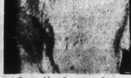
Entry No. 6... Clumber Spaniel.