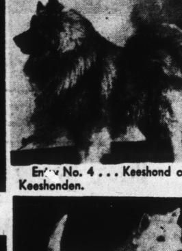
Entry No. 4... Keeshond or Keeshonden.