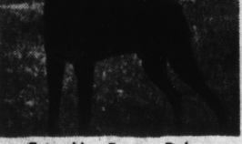
Entry No. 5... Doberman Pinscher.