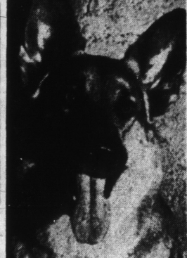
Entry No. 2... German Shepherd.