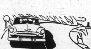
5-Inch Wide-Base Rims, plus Low-Pressure Tires

Slam the door and hear the difference! That solid, muffled thud speaks of steel welded to steel all around you. Fisher Unisteel Construction brings you unsurpassed solidity, quietness and safety—another extra value exclusively yours at lowest cost in Chevrolet!