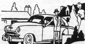
Fisher Unisteel Body Construction

That large, smartly curved windshield sweeps back to narrower corner posts to provide a wider, safer view. Alone in its field, Chevrolet gives you the functional beauty of a curved windshield—another extra value exclusively yours at lowest cost in Chevrolet!