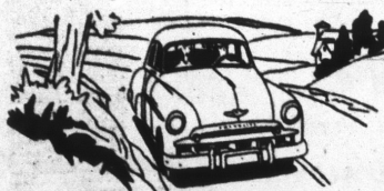
Extra Economical to Own and Operate

Chevrolet and Chevrolet alone offers you all these EXTRA Values at lowest cost!