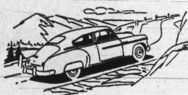
World's Champion Valve-in-Head Engine

Chevrolet's exclusive brake design is more outstanding than ever for swifter, safer stops. New Dual-Life, rivetless brake linings last up to twice as long. Extra safety and economy are combined in this extra value exclusively yours at lowest cost in Chevrolet!