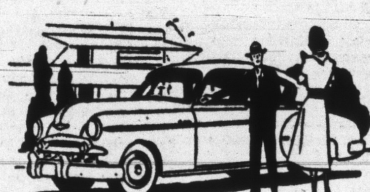
Fisher Body Styling and Luxury

Steering control is centered between the wheels to give you amazing new ease of control with minimum fatigue. You'll find Center-Point Steering only on Chevrolet and higher priced cars—an extra value exclusively yours at lowest cost in Chevrolet!