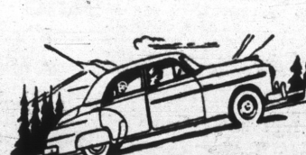
Longer, Heavier, with Wider Tread

You get the widest rims in the low-price field plus extra low-pressure tires as standard equipment. That's another reason for the extra smoothness, softness and stability of the Chevrolet ride... another extra value exclusively yours at lowest cost in Chevrolet!