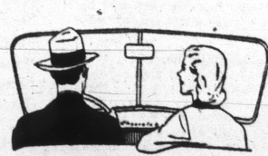
Curved Windshield with Panoramic Visibility

It's the lowest priced line in its field. It's the outstandingly economical performer. And it's America's most wanted motor car—new or used—traditionally worth more when you trade. It all adds up to another extra value exclusively yours at lowest cost in Chevrolet!