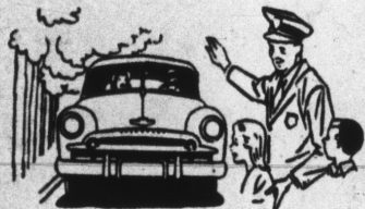
Certi-Safe Hydraulic Brakes

Chevrolet's exclusive brake design is more outstanding than ever for swifter, safer stops. New Dual-Life, rivetless brake linings last up to twice as long. Extra safety and economy are combined in this extra value exclusively yours at lowest cost in Chevrolet!