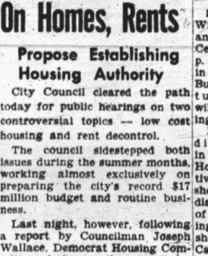
City Council member

Propose Establishing Housing Authority City Council cleared the path today for public hearings on two controversial topics — low cost housing and rent decontrol.