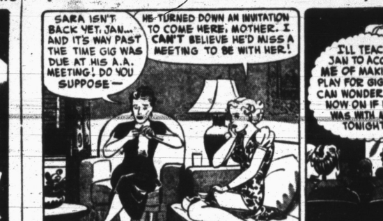
ROOTS AND HER BUDDIES Girls Like Sunday Cutouts