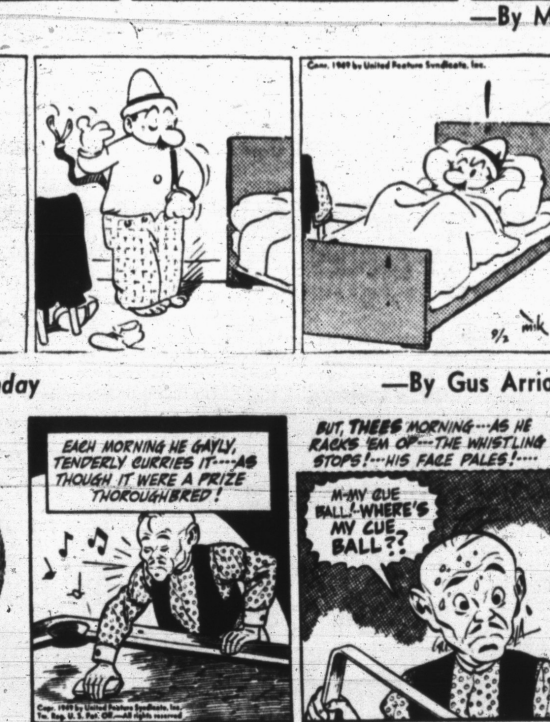
—By Gus Arriola