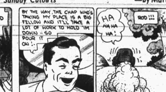
U. S. REG. U. S. PAT. OFF.