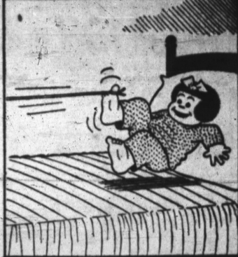
—By Al Capp