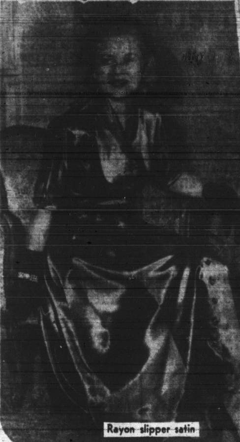
Rayon slipper satin