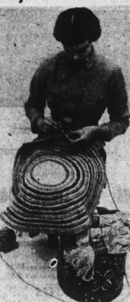
New rayon yarn makes scatter rugs.

EASY to handle... works up in no time at all. That's the success story of Avisco rayon yarn, the new rug material that is causing even amateur needleworkers to get busy crocheting scatter rugs. It's called "Lusterspun," and a beginner can make a 25-inch circular rug in a day.