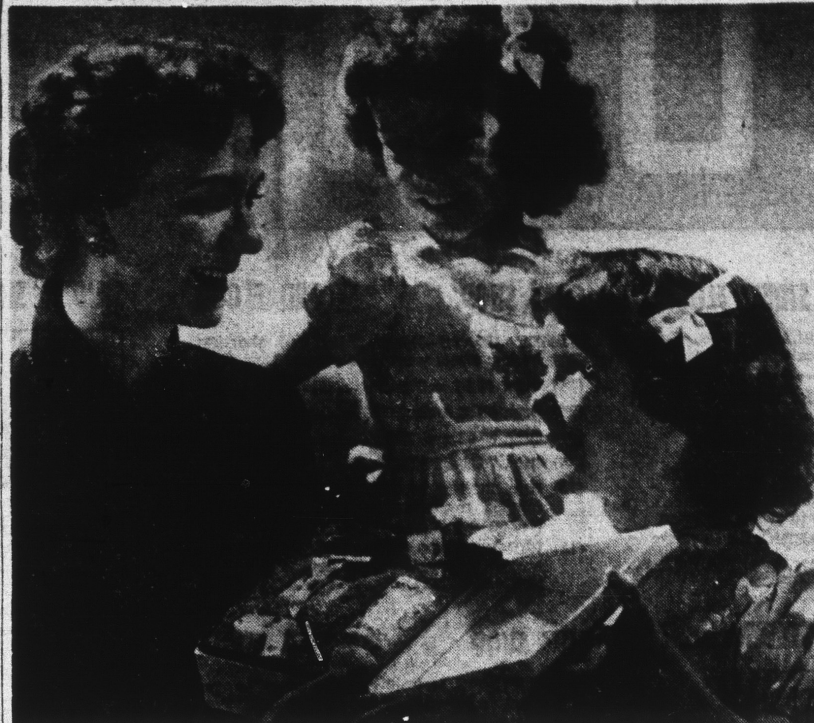
Sunday Mother will be remembered with material affection, a lovely gift to flatter her vanity.