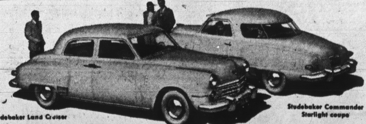
Studebaker Land Cruiser

Let's give you the names of Studebaker owners to check with. You'll be amazed to learn what they save.