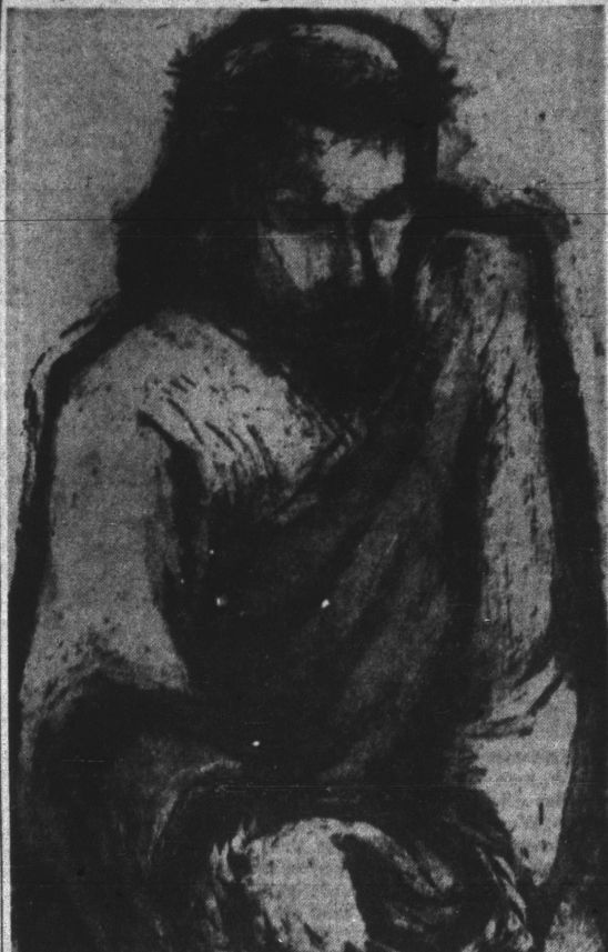
The "Ecce Homo" on aquatint depicting Christ with the crown of thorns executed by Orfeo Vian, expresses the spirit of Holy Week.