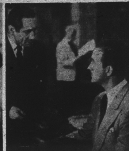
With the exception of Mr. Botts (Broderick Crawford), everyone in the house is just one happy family. Botts works nights and constantly complains of the noise made by the other tenants in the daytime. Eric moves a piano into Polly's apartment and drives Botts away with his playing.