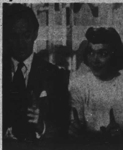
When Bruce calls at Polly's apartment, Polly learns the truth about the insurance deal. She is disappointed in Eric's lack of faith in her, and denounces Bruce and the crafty manager for interfering in her love life, then breaks down at the thought of losing Eric because of them.