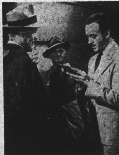
Bruce and Buloff are waiting at the station with the policy. Eric signs, then making sure his hands are insured, wallops both of the connivers. They say goodbye to their friend Willoughby, and climb aboard the train. Eric takes out his practice keyboard which he uses to occupy himself while traveling. Polly's answer is to throw the keyboard out the vestibule door as the train pulls away.