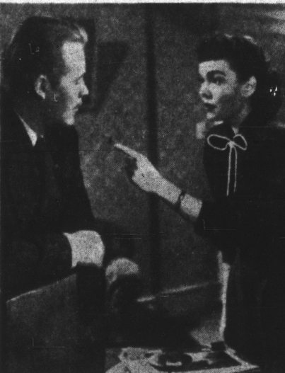
Polly's boy friend, Bruce Arnold (Wayne Morris), offers Eric's crafty manager (Joseph Buloff) half the commission to help him sell Eric an insurance policy on his hands. Eric learns of the deal. Buloff tells him that Polly is also in on it. Disillusioned, Eric decides to go to the West Coast.