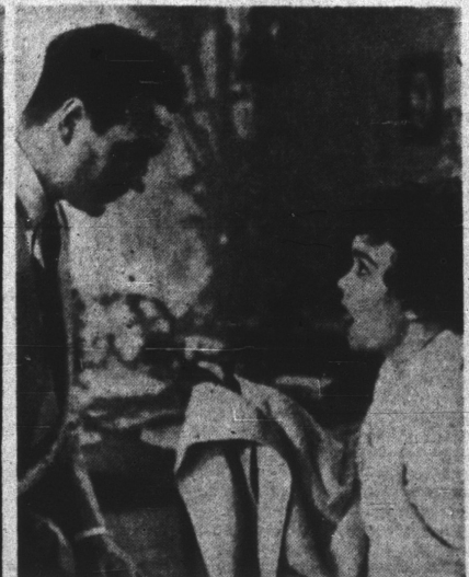
Eric returns to Polly's apartment to get some music he left behind. Willoughby locks Eric in where Polly discovers him when she steps out of her bath. Words fly and Eric learns the truth about the insurance deal. He convinces her of his love and they rush off to catch the train.