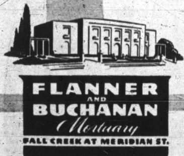
FLANNER AND BUCHANAN Mortuary 333 CREEK AT MERIDIAN ST.