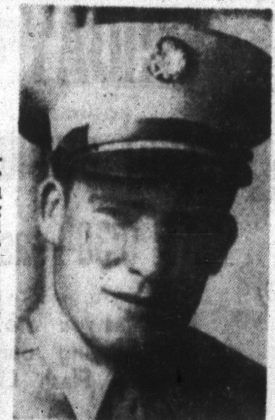
T-5 Axsom... services Saturday in Fleming Gardens Christian Church.

SAFE NIGHT DRIVING Nighttime safe automobile speed is below the maximum at which a car can be stopped within the range of its lights.