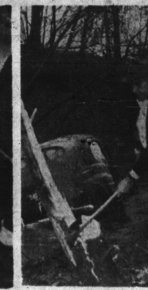
Mr. Ruhton had to cut down a tree to make a path for the car to come out. The car was removed after the waters receded.