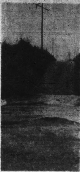
Two men who attempted to travel this road during Tuesday night's downpour got into more trouble than they had bargained for.