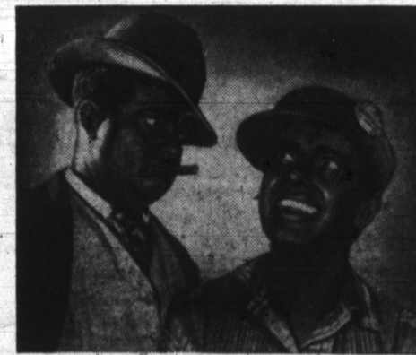
6:30 PM AMOS 'N' ANDY . . . . . that's all you need!