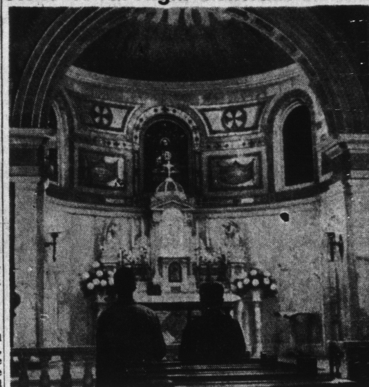
The Blessed Sacrament Chapel with its mosaics and marble statuary will be the scene of all-night veneration of the Sacrament.