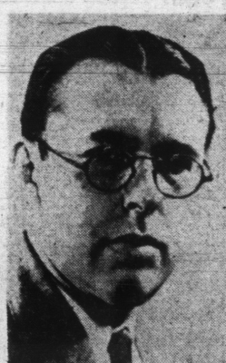
AUTHOR —Carey McWilliams will speak on "To Secure These Rights," Dec. 8.