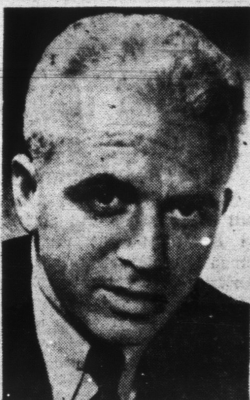
CORRESPONDENT —Leland Stowe will speak on "Berlin, Europe's Powder Keg," Nov. 17.