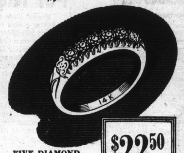
$22.50 FIVE DIAMOND WEDDING RING Each diamond individually set in fashionable fishtail prongs. Band of 14-K. gold.