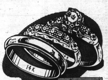
$85 8-DIAMOND WEDDING SET matching three-piece, handsome ring for the groom, all 14-K. gold.