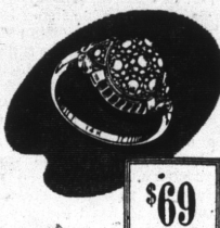
$69 7-DIAMOND CLUSTER set to look like one large solitaire diamond. Ladies' or gents'.

These beautiful diamond ring ensembles represent the kind of style, quality and value which through the years have earned for Barney's a reputation for diamond leadership. We have sketched here but seven of the many dozens from which to choose.