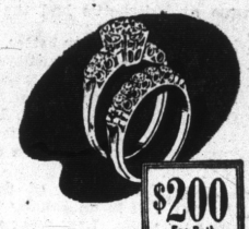
$200 DIAMOND FISHTAIL BRIDAL PAIR ... Each diamond is individually prong set.