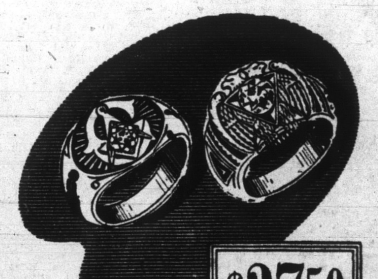
$37.50 Diamond Scottish Rite or Diamond Blue Lodge Ring. In Yellow Gold Mounting.