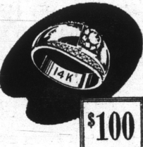
$100 MEN'S DIAMOND RING. Set in 14-K. gold mounting. Very masculine.