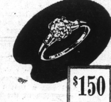
$150 SOLITAIRE ENGAGEMENT RING. Brilliant diamond set in 14-K. yellow gold mounting.