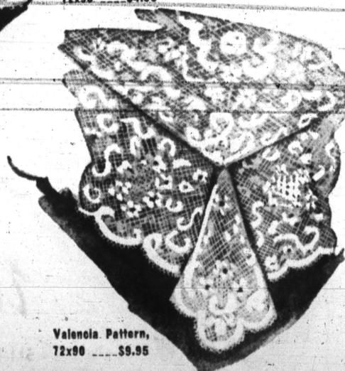
Valencia Pattern, 72x90 — $9.95

Keep Your Table at Its Prettiest With "Wilbarry" Lace Dinner Cloths