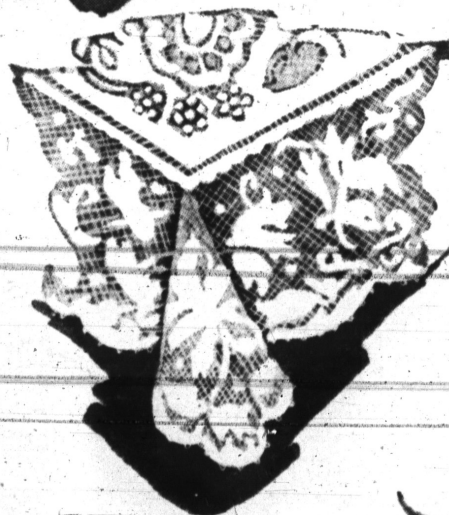
Cardova Pattern, 72x90 — $4.50

Baltimore Camelia Barony Mullane Chateau Wickford Waverly Valencia