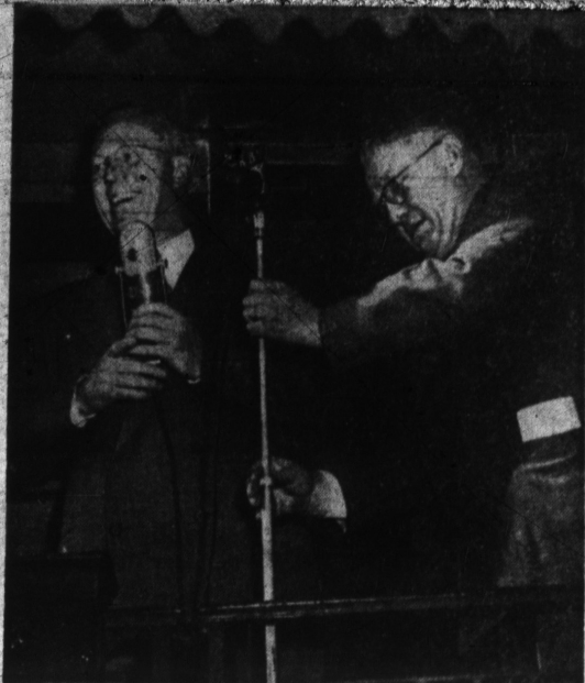
INDIANA JOURNEY —This was the first of five stops yesterday for Gov. Earl Warren's campaign train as it whipped through Hoosierland. The California governor was met at Richmond where Indiana GOP big-wigs boarded for the junket. While Gov. Warren spoke, Gov. Gates accommodatingly arranged a second microphone.