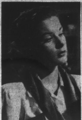
SCORNFUL — Jean Peters, who scorns Dana Andrews' career as lobster-fisherman in "Deep Waters," drama currently at the Lyric.