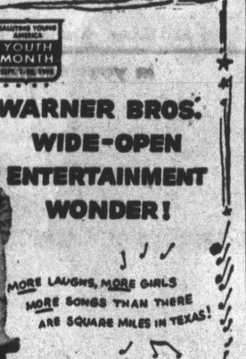
NOTE FROM a reader: "Why doesn't Hollywood do something about the type of entertainment on the screen?"