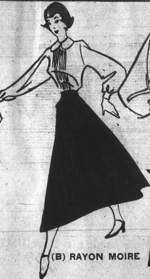
(B) RAYON MOIRE