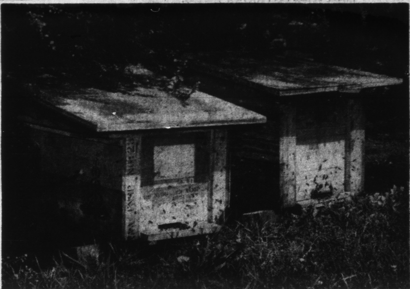
BEES LIKE RILEY —Two colonies of bees decided they like the shaded, pleasant surroundings of Riley Hospital. They settled there and refused to budge. Maintenance men provided proper housing. Now, the bees are making honey.