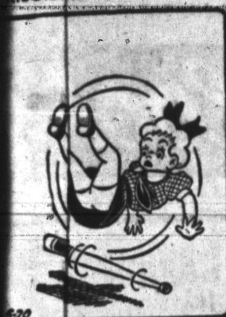
—By Al Vermeer