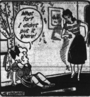
—By Al Capp