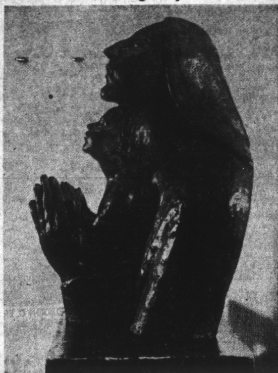
"TEACHING THE CHILD TO PRAY"—This bronze of a mother and child in prayer typifies the intense yearning and universal message of the religious sculptures of Ivan Mestrovic.

This group of Mestrovic's pieces will remain in the Herron galleries until April 15.