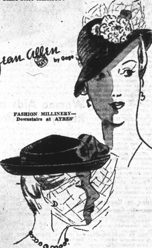
FASHION MILLINERY—Downstairs at AYRES'

With Easter just around the corner, you'll want to see our large selection of women's fashions... styles that are designed especially to fit and flatter the mature woman. Select your Easter Costume in AYRES' Downstairs Store tomorrow!