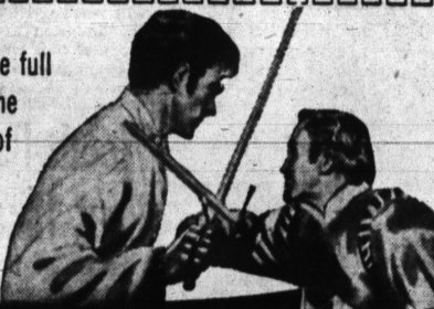
DARRYL F. ZANUCK

Here is the full surge of the conquest of gold and empire!