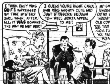
ABBY AN' SLATS