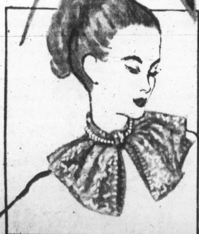
B. Jacquard rayon sheer, white, pink, blue, black—2.00