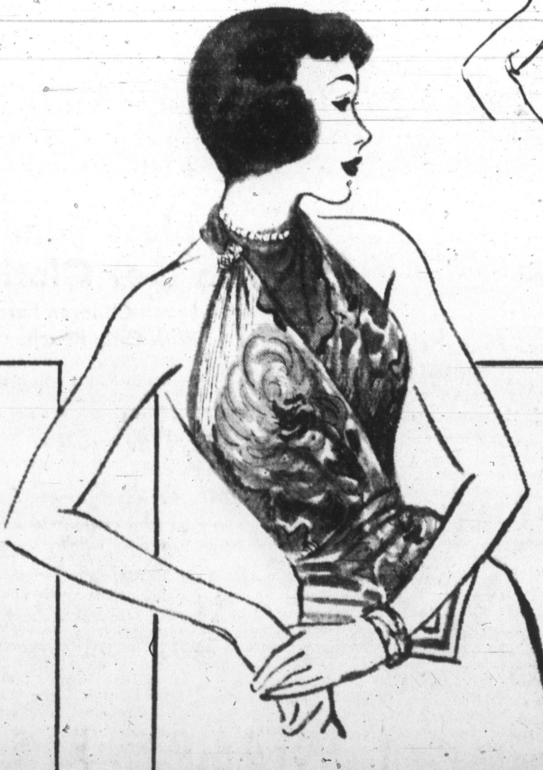
D. Tissue silk, assorted prints—3.00