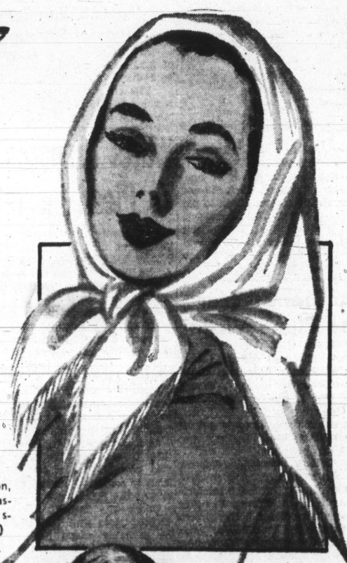
G. Spun rayon head square, white and assorted colors—1.00