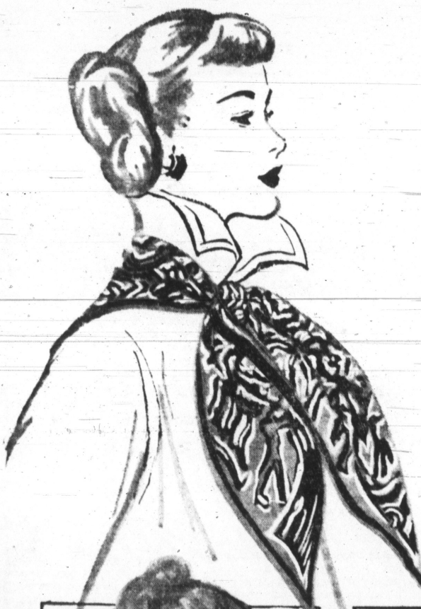
A. Pure silk square, assorted prints—3.98

Whatever her type, whatever her age, she can't have too many scarfs! Head squares, long scarfs, and tie-as-you-will 21" and 36" squares. You'll find just the right one for her among these pure silks, rayon sheers and spun rayons—in a wide assortment of ombres, plain colors and floral and conversation prints!