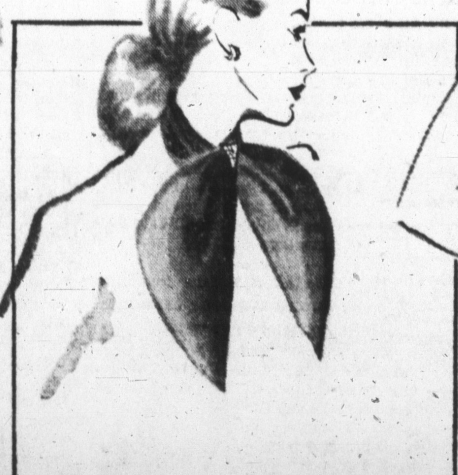
C. Pure silk ombre, assorted colors—2.00