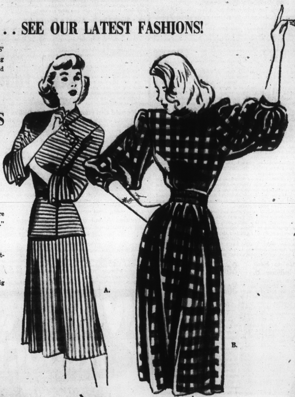
FASHION DRESSES—Downstairs at AYRES'