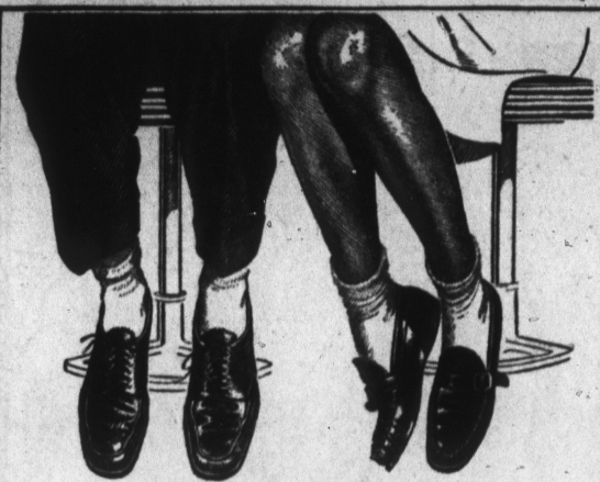
the last stop ... still shining!

THE SHINE THAT STAYS because it has a hard-wax finish!