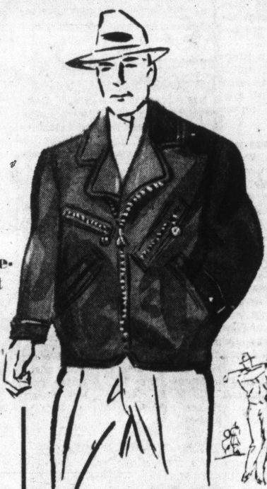
Style D. Capeskin Jacket Adjustable Features

Zipper front jack- et with two zip- per pockets, two flap pockets, leather collar! Sleeves and sides are adjustable. Lined with heavy poplin. Half belt- ed extra full back in dark brown only.