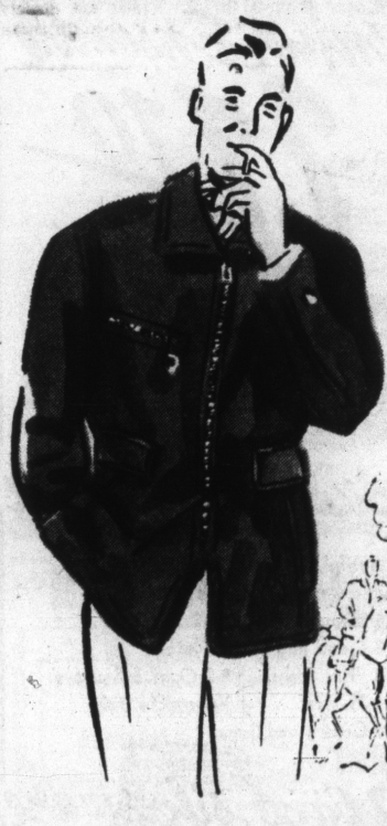
Style C. Six Pocket, Zipper Cape-skin Jacket

Full length jack- et with zipper front, two zipper and two flap, and two slash pock- ets. Heavy rayon twill lining. Reg- ular sleeves. Half belt and bi-swing pleated back! Dark brown.