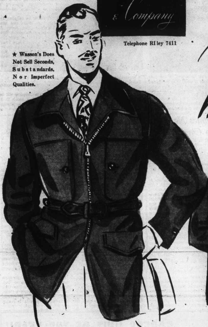
Style A. Genuine Goatskin Full Length Coat

★ Wasson's Does Not Sell Seconds, Sub standards, Nor Imperfect Qualities.