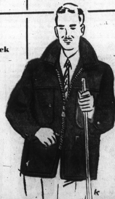
Style J. Brown Suede Coat, Cotton Plaid Lined

Zipper coat style with four pock- ets. Fully belted. Made of fine quality suede leather. For all sports. Sizes 36 and 38 only.