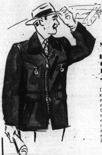
Style E. Full Length Capeskin Leather Jacket

Dark brown cape- skin leather jack- et with six pock- ets, two zippers, two flaps, two slash. Has leath- er collar, regular cuffs and bi- swing back with extra fullness. Zipper front.