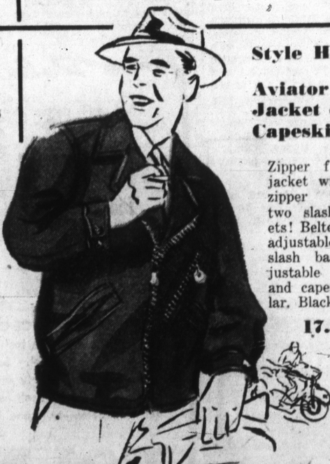
Style H. Aviator Style Jacket of Black Capeskin

Zipper front jacket with two zipper pockets, two slash pock- ets! Belted back, adjustable sides, slash back, ad- justable sleeves and capeskin col- lar. Black only!