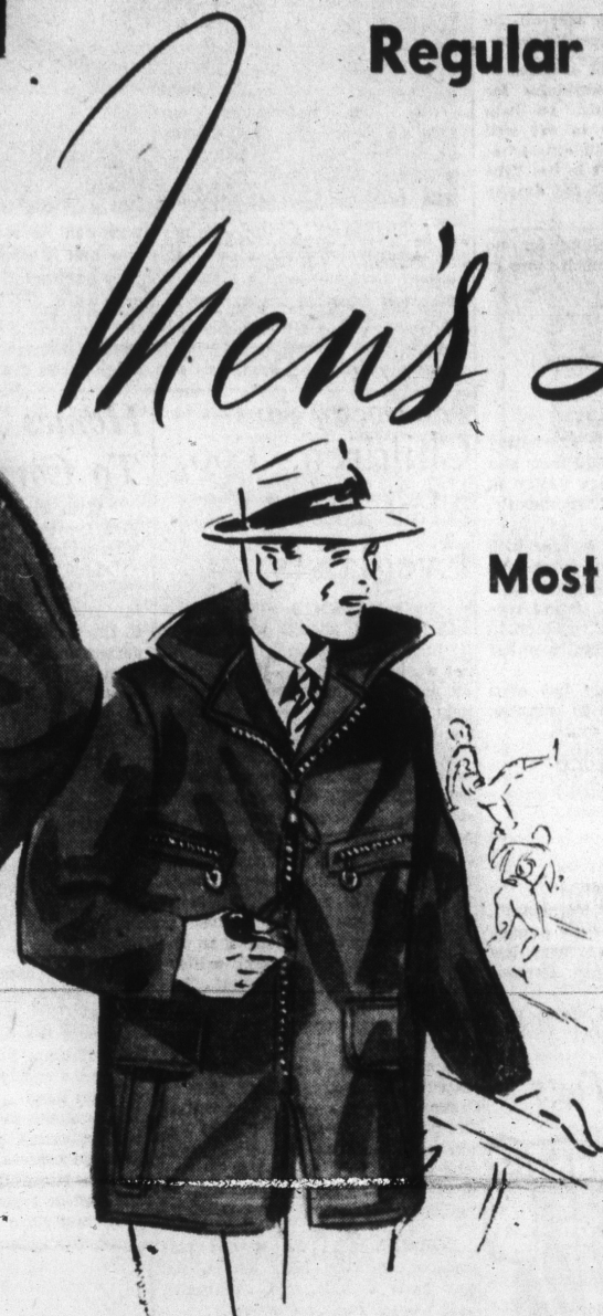
Style B. Zipper Front, Ponyskin Jacket

Styled with zipper front, full-belt (removable in front), four pockets, bi-swing back. It is fully-lined with beautiful cotton plaids! Has regular cuffs, leather collar. Sizes 36, 38 and 40 only. 17.50