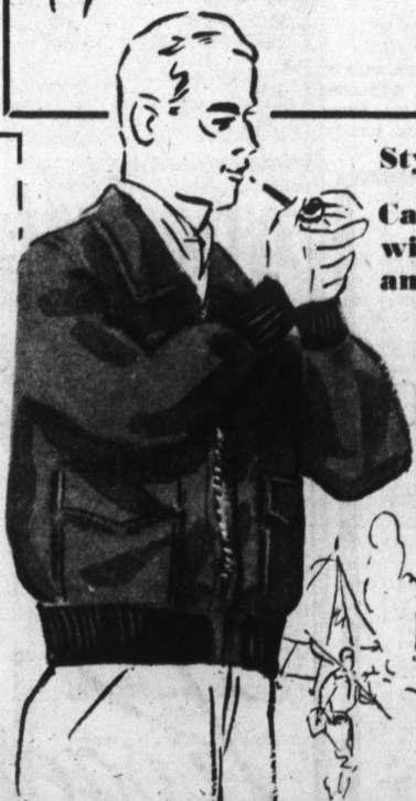
Style G. Capeskin Coat with Knit Cuffs and Waist

Name ..... Street ..... City ..... State ..... Charge Check C. O. D.