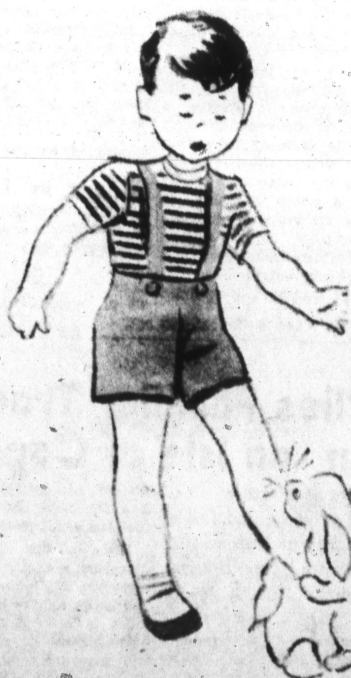
Carltona Knits 3.00

Full-cut suspender suits of durable Carltona cotton-knit which keeps its shape and washes so well! Blue or grey shorts with contrasting striped shirts... size 3-6x. Mail and phone orders accepted.