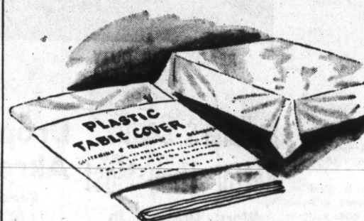
Plastic Table Cover 89c

China and Glassware, Fifth Floor Sketched is the Apple Tea-and-Toast Set, service for 4, 1.00. Also Apple Cups and Saucers, 16 pcs., 1.00; Apple Salad Plates, 8 for 1.00! Apple Dessert Dishes, 8 for 1.00. Mail and phone orders accepted.