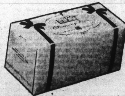
NCC Solka Cleansing Tissues