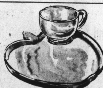
Apple-Pattern Glassware 1.00 Set

China and Glassware, Fifth Floor Sketched is the Apple Tea-and-Toast Set, service for 4, 1.00. Also Apple Cups and Saucers, 16 pcs., 1.00; Apple Salad Plates, 8 for 1.00! Apple Dessert Dishes, 8 for 1.00. Mail and phone orders accepted.