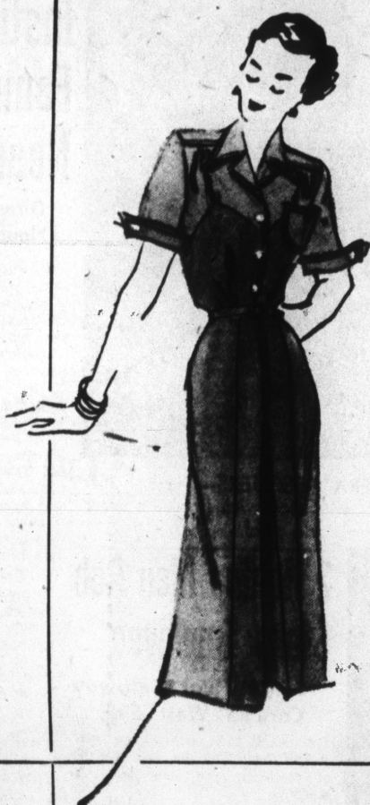
New Shirtwaist Classic by Slendeze 7.95

Black rayon alpaca... cool and comfortable for town now, perfect for warm fall days... trimly tailored with convertible collar, new soft skirt. Sizes 12 to 20 and 38 to 48. Mail and phone orders accepted.