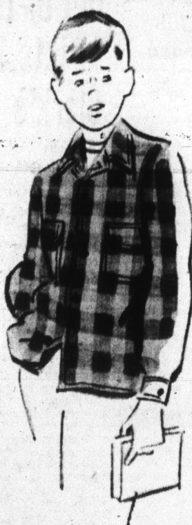
Wool Jac-Shirt 6.95

OPEN ALL DAY SATURDAYS CLOSED MONDAYS Shop Tuesday Thru Saturday 9 AM to 5 PM