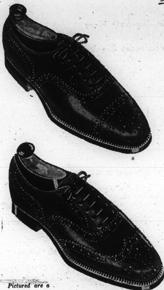
Pictured are a few styles—there are a hundred or so others.

OXFORDS FOR BOYS— are also—on the Mezzanine! Young gentlemen styles—smooth—and for rugged service. Moderately priced—The Strauss Fitting Service Extraordinary.