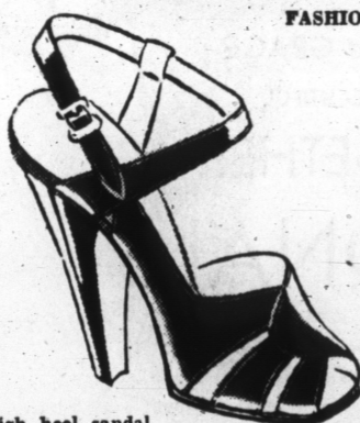
High heel sandal with open toe and heel. Sizes 4 to 9, AA-B.

FASHION ACCESSORIES—Downstairs at AYRES'