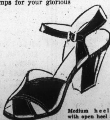
Medium heel sandal with open heel and toe. Sizes 4 to 9, AAA-B.