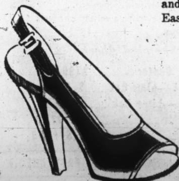
High heel sling back pump with wide open toe and open heel. Sizes 4 to 9, AA-B.

Spring brings black patent into the limelight . . . shiny patent fashioned into sandals and pumps for your glorious Easter.