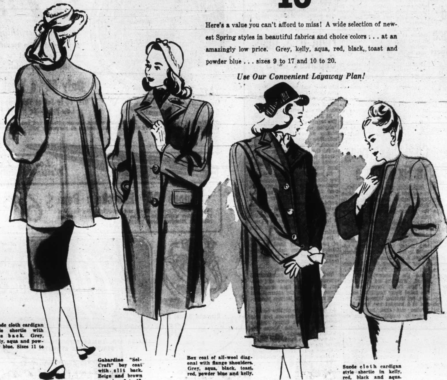
Suede cloth cardigan style shortie with yoke back. Grey, kelly, aqua and powder blue. Sizes 11 to 15.