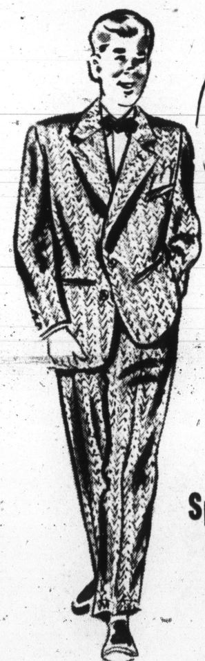
Boys' Spring Suits $19.98

SHOP EARLY AT AYRES' 9:00 TO 5:25 TUESDAY THRU SATURDAY CLOSED MONDAYS