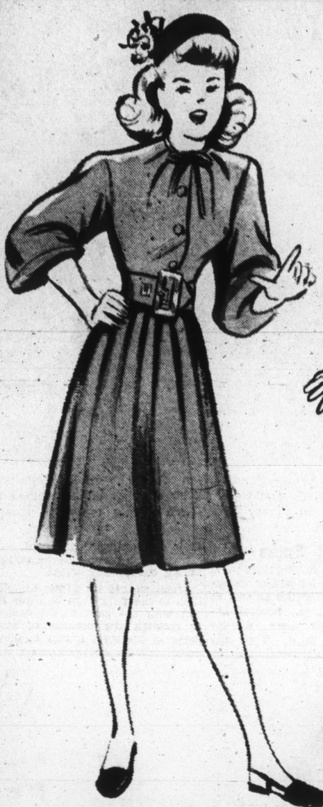
Teens Choose Rayon Luana $8.98