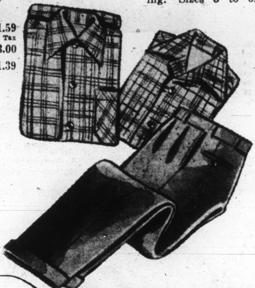
GABARDINE SLACKS $5.98

Colorful plaids that will give a "zip" to your outfit. Long and short sleeves... all sanforized and fast color. Blue, tan and green plaid... sizes 8 to 16.