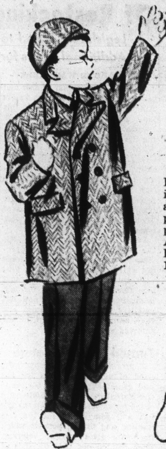
Little Brother COAT SET $8.98

He'll be a match for Dad in his double breasted diagonal tweed coat. Expertly tailored, with two pockets and a rear pleat. Also matching Eton cap. In blue and tan... sizes 1 to 3, 3 to 6.