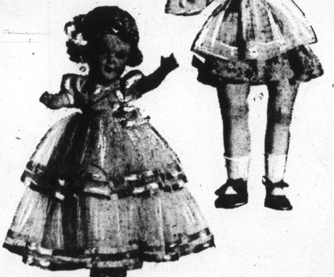
Tiny Mannequins for Young Dressmakers

"As I went walking down the street, I met a dolly mighty sweet." She's 24 inches tall, blonde or brunette, at . . . $14.98 Or 20 inches tall at . . . $9.95