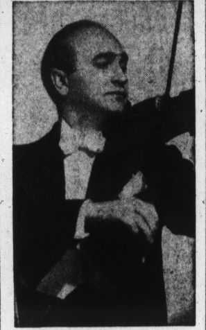
Dave Rubinoff, popularly famed violinist, who will appear at the Murat theater Nov. 1 under the sponsorship of the Indianapolis Junior Chamber of Commerce.