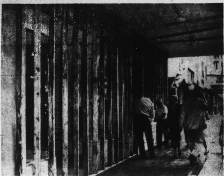
Getting ready for the hurricane in Miami. Boarding up a women's wear shop on Flagler st., the main shopping center there. Note man holding hat on right.