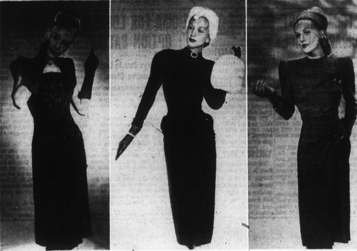
By LOUISE FLETCHER

IT SEEMS AS IF practically all the designers, before they picked up sketching pencils or shears to work on fall and winter clothes, had heard of the injunction, "Look pretty, please."